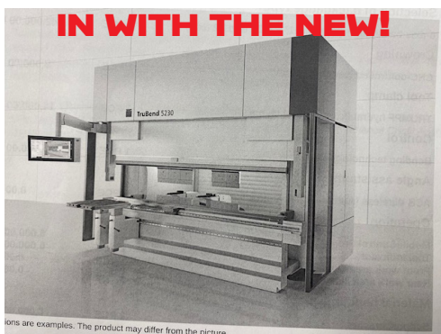
ions are examples. The product may differ from the picture.